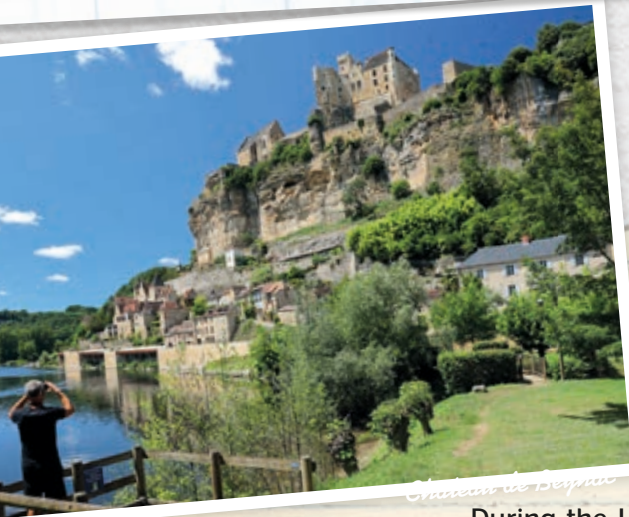
Château de Beynac

the rhythm of footsteps and water: take your time!