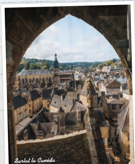
Sarlat la Canéda