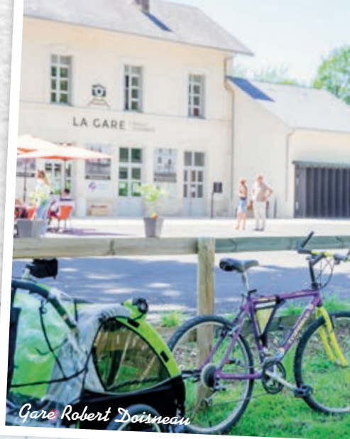
Gare Robert Doisneau

The rail station of Carlux was remodeled into a museum in 2018 to display photos by Doisneau and other exhibits.