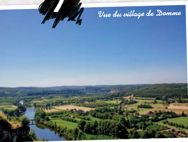
Vue du village de Domme

Going up the Dordogne River you'll see Domme : a bastide, located on top of the cliff, built more than 700 years ago by the King of France.