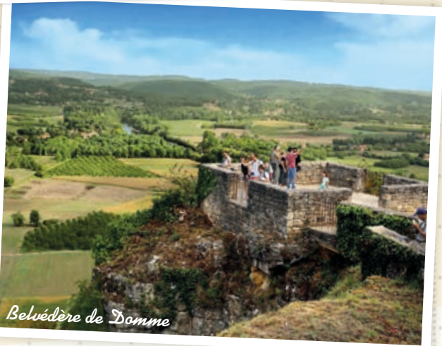
Belvédère de Domme

From the Belvedere de la Barre, discover breathtaking views of the Dordogne valley. Following the Dordogne, you will be surprised by the hamlet at the foot of the Chateau of Montfort.