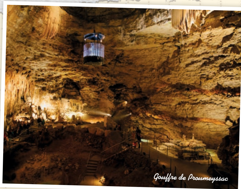
Gouffre de Proumeyssac