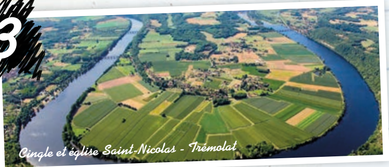
Cingle et église Saint-Nicolas - Trémolat

Departure from Périgueux (market days in the morning on Wednesday and Saturday) and follow road N21 to reach road D8 (50 km) to reach the top of the Cingle de Trémolat (Meander of Trémolat): a breathtaking vista, resulting from natural erosion of limestone over thousands of years.