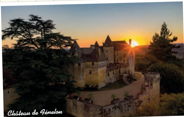
Château de Fénelon

Access to the chateau is protected by three consecutive fortified walls and a rich collection of artworks is displayed in the middle of ancient furniture and the memories of this character who has marked his time and region.