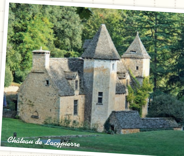
Château de Lacypierre